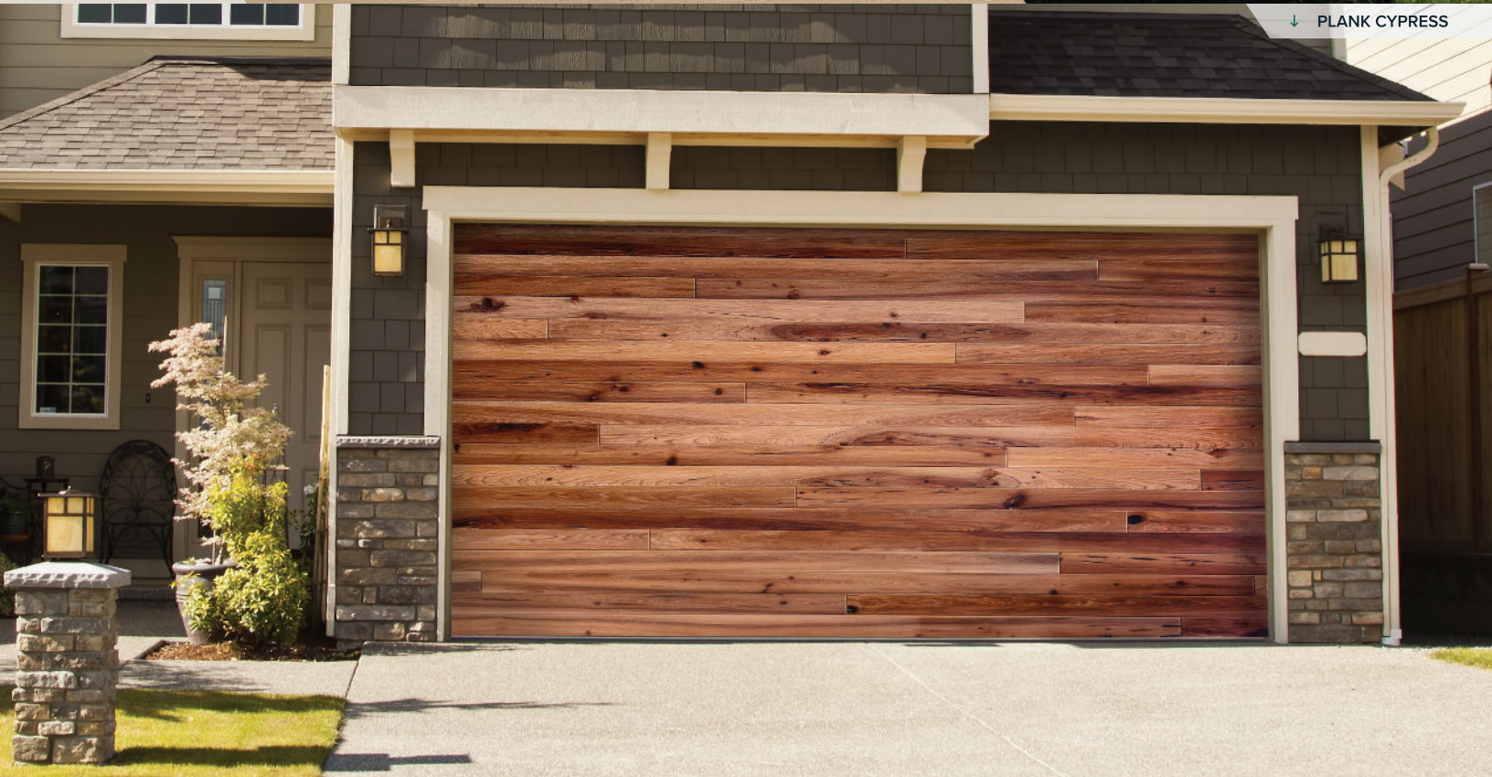
↓ PLANK CYPRESS