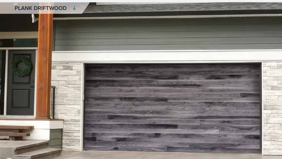
PLANK DRIFTWOOD ↓

View all the specs for this door online at doorLinkmfg.com