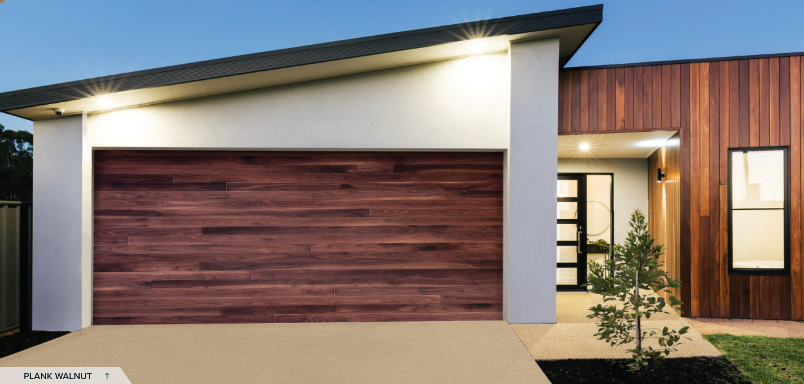
PLANK WALNUT ↑